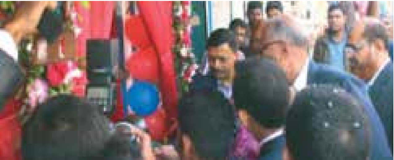
DGDA has inaugurated 289 Model Pharmacy and Model Medicine shop in 20 districts of the country. Inauguration of Model Pharmacy and Model Medicine shop in Bogra, Gaibandha and Rangpur.